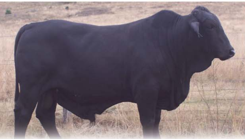
Lot 91: Elara 368 DOB: 18/09/08 Sire: Sunnyside He Man Very quiet, deep bodied sire eligible for registration.