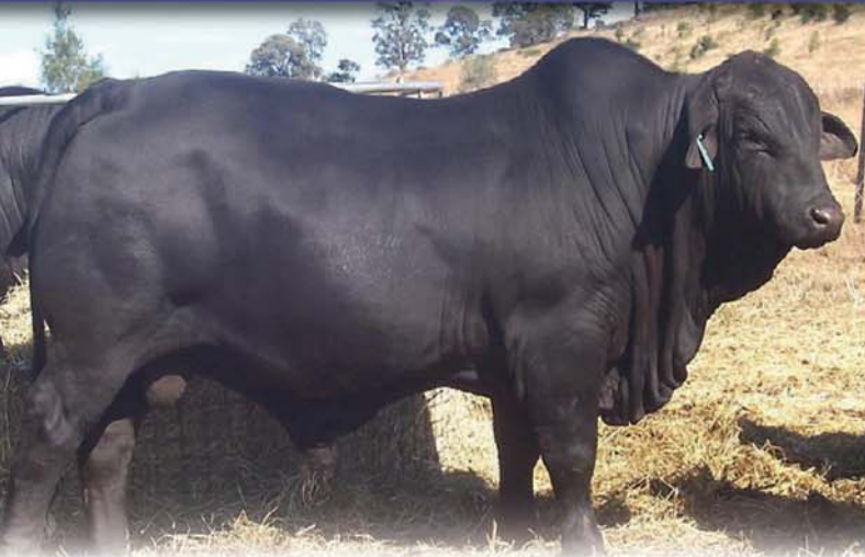
Lot 90: Elara Advance DOB: 08/08/08 Sire: Charlevue Adjourm Very quiet, well muscled bull with a sirey outlook.