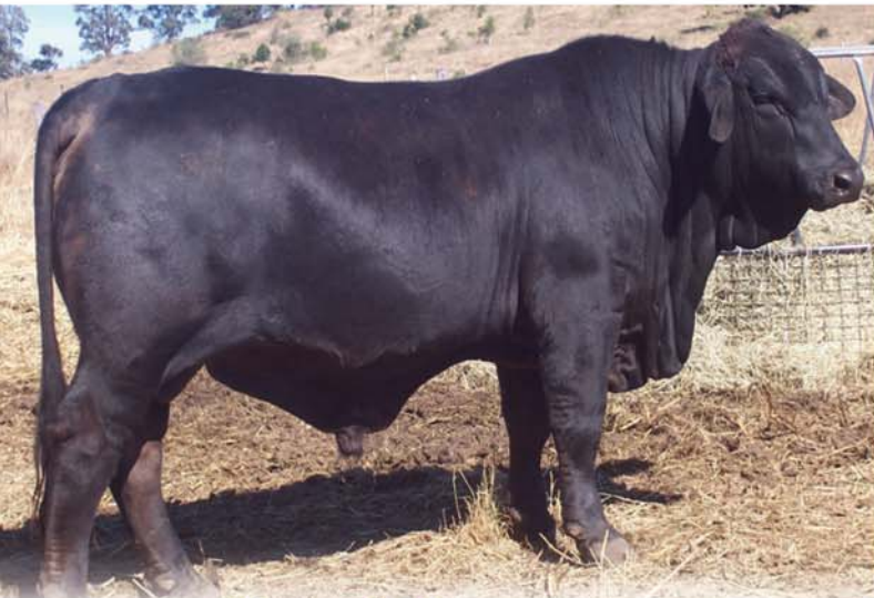
Lot 88: Elara 349 DOB: 09/08/08 Sire: Greendale Y629 Very quiet, long, well muscled bull.