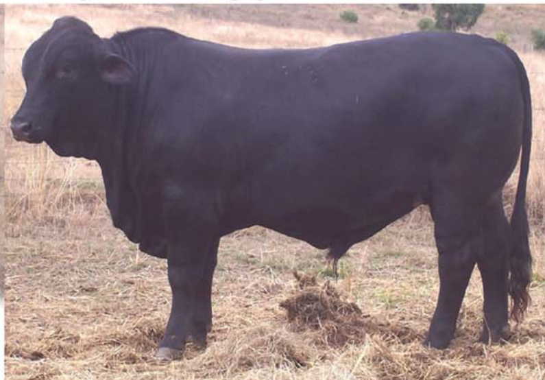
Lot 89: Elara George DOB: 13/09/08 Sire: Greendale Y629 Long, well muscled, high growth sire with a tidy sheath.

BREEDPLAN FIGURES AVAILABLE ON ABCA WEBSITE